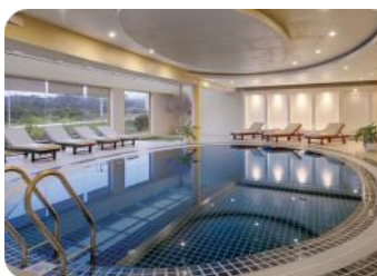
Indoor Swimming Pool