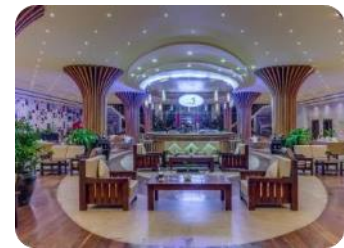
Lobby / Champa Café