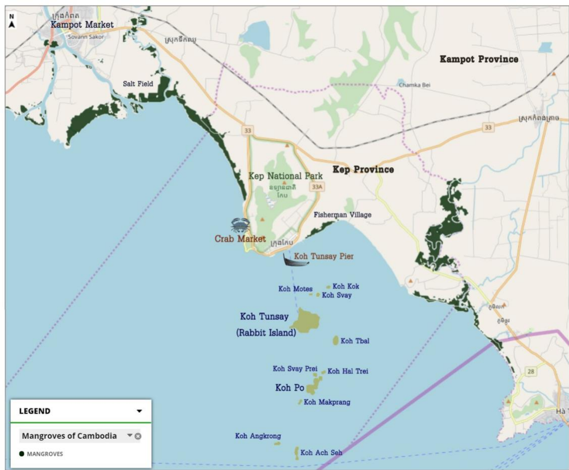
Figure 1: Kep map

Mangrove Forest is ecosystem in coastal areas and serves as habitat to the following endangered species: Green Turtle, Blood Cockle, Migratory Dolphins, Mud Crab, Swimming Crab, Grouper, Kelee Shad, Chacunda gizzard Shad, Blue Spotted Maskray, Himantura spp. (sting ray), Javelin Grunter, and Deep body Silver biddy (FiA. 2017). Mangrove forest in Kep covered 1.005 ha and declined from 30% to 40% during 10 years ago, causing from salt farm and coastal developments.