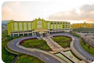
Thansur Sokha Hotel

Thansur Sokha Hotel is the first and only highland resort in the Mekong Sub-Region amid the pristine jungle wilderness and pleasant cool weather on the beautifully landscaped hill on the Bokor Mountain, Kingdom of Cambodia. The hotel offers rooms and suites decked out with modern Khmer art and equipped with latest amenities. All guestrooms are comfortable served with world-class service which offers premium services and facilities such as 4 style restaurants and 2 bars, fitness centre, spa, sauna, Jacuzzi, indoor and outdoor swimming pool, Cloud 9 Kids Club, KTV, Disco Club and Entertainment Centre (Casino). For participants who prefer to stay connected, wireless internet access is available throughout the hotel with compliments and Shuttle service between the resort and Phnom Penh city is also available at a charge.